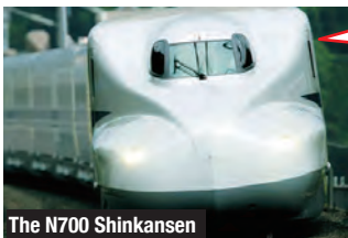
The N700 Shinkansen