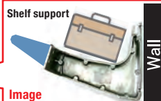
Image The world's first magnesium alloy usable in railroad vehicle.

Taking advantage of its light-weight and high specific strength/rigidity, it is in practical use as a shelf support.